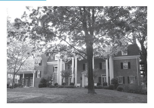
The Phi Delta Theta house is in need of necessary upgrades to remain a competitive facility at UNC.

Despite Bob's efforts to maintain the building, certain areas of the house need updated. Mindful of the importance of always presenting an attractive, top-notch facility for current and future brothers, the NC Beta Foundation has reviewed a series of proposed construction