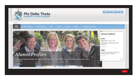
To Get Current News, Share Memories, See the Honor Roll, AND TO DONATE! Visit our Website: uncphidelt.com

"I'm happy to contribute to meet our goals. It is a small price to pay for the life-long benefits I got from Phi Delta Theta."